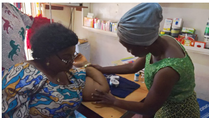
A trained Nurse (Tier2 PPMV) demonstrating her skills in insertion

As part of efforts to strengthen quality of services, the project commenced Integrated Supportive Supervision (ISS) involving relevant stakeholders during the quarter. In Lagos, a total of thirteen (13) facilities were visited within the three days of the activity in Alimosho LGA, 2 of which were tier 2 PPMVs, 1 CP and 10 Tier 1 PPMVs. ISS team included staff from Lagos State Ministry of Health (LSMOH), PCN and the State Primary Healthcare Board (LSPHCB).