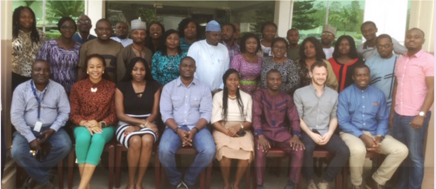
Partners at the Implementation plan meeting