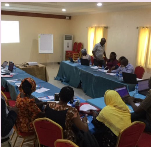
Cross section of participants during the Mobile DHIS2 System TOT

Preparatory to the deployment of about 800 mobile phones configured with the mobile DHIS2 System to all the trained Community Pharmacists and PPMVs in Lagos and Kaduna States, the IntegratE project organised a 3 - day training of trainers workshop in Akwanga, Nasarawa state.