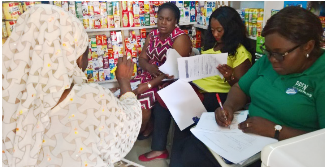
The team from the State discussing with a PPMV during the ISSV in Lagos