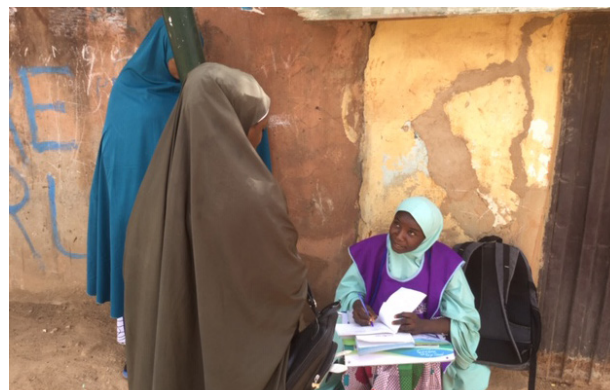
IPCA issuing referral card at Angwan Dora, Kaduna North

They will also explore the use of social Media - Facebook, Instagram, twitter and WhatsApp to send regular messages to the youth about healthy living and making great life choices. Young girls are also linked to SFH "9galnow" interactive platform on Facebook where they can send private messages on sexual and reproductive issues and get prompt feedbacks from trained counsellor, while those that require family planning services are referred to appropriate facilities.