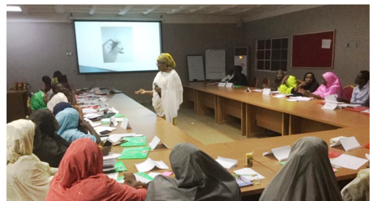
PPMV Tier 2 Training in Kaduna

The IntegratE project trained 38 Tier 1 (Non-Health trained PPMVs) and 48 Tier 2 (Health trained PPMVs) in Kaduna State and 18 Tier 2 PPMVs and 42 Tier 1 PPMVs in Lagos within the quarter. This brings the total number of trained Tier 1 PPMVs (Non-Health trained PPMVs) to 320 and the Tier 2 (Health trained PPMVs) to 179.