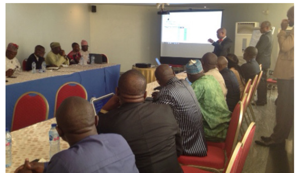
Cross section of PCN directors and staff during the OCA Session

As a first step towards strengthening the capacity to effectively monitor and supervise the PPMV in the tiered accreditation system, the IntegratE project supported the Pharmacist Council of Nigeria (PCN) in carrying out an Organizational Capacity Assessment using the National Harmonized Organizational Capacity Assessment tool (NHOCAT).