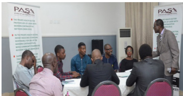
Stakeholders meeting to develop a road map for expansion of APML

The Pharmaceutical Society of Nigeria Partnership for Advocacy in Child and Family Health (PSN-PACFaH) convened the first stakeholders meeting to review the Approved Patent Medicines List (APML) to reflect the commodities expected to be stocked by each Tier of the PPMVs in line with the Tiered accreditation system.