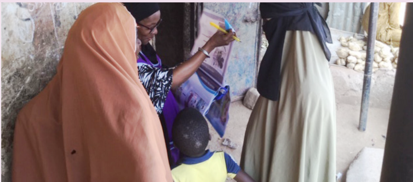
IPCA having a session in layin Sarki, Kaduna North