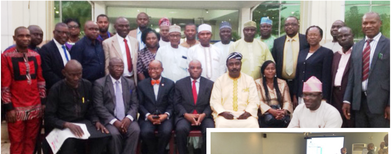
The Registrar (Middle) and other senior staff of PCN

As a first step towards strengthening the capacity to effectively monitor and supervise the PPMV in the tiered accreditation system, the IntegratE project supported the Pharmacist Council of Nigeria (PCN) in carrying out an Organizational Capacity Assessment using the National Harmonized Organizational Capacity Assessment tool (NHOCAT).