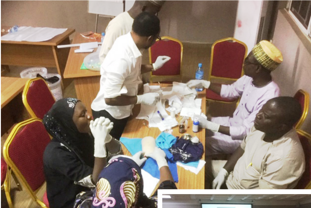
Practical demonstration of implant insertion using arm model during Tier 2 PPMV training in Kaduna