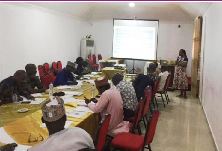
Meeting with Provosts and Heads of schools of Health Technology on the accreditation training of PPMVs

The Pharmacists Council of Nigeria will subsequently undertake facility visits to the schools that have shown interest to access the infrastructure and sign Memorandum of Understanding (MoU) before commencing the training.