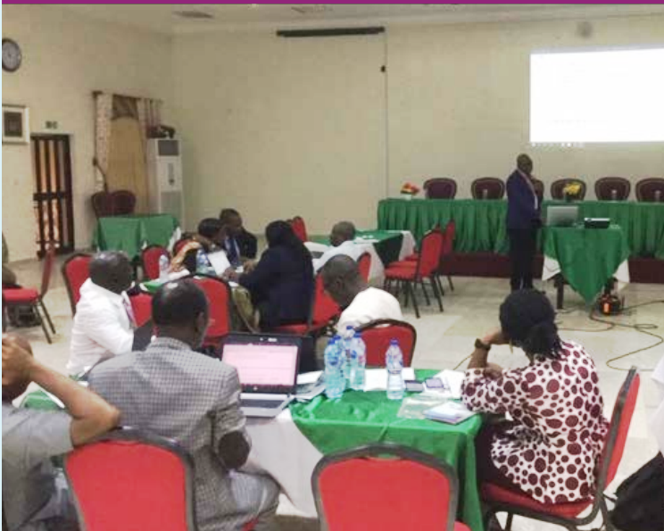
Stakeholders' meeting to review and validate the new PPMV training manual developed in line with the accreditation curriculum

Preparatory to the commencement of the roll out of the tiered accreditation training by PCN, the IntegratE project worked with the Council, other implementing partners and relevant departments of FMOH to convene a stakeholders' meeting to review and validate the training manual of PPMVs which was developed in line with the tiered accreditation curriculum covering all topics from family planning, malaria, pneumonia, diarrhea as well as regulatory and operational procedures.