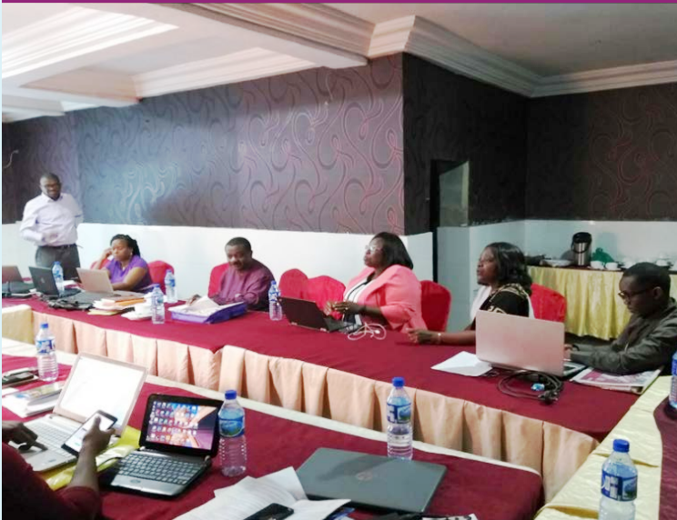
PCN Directors at the co-creation workshop on digitisation of PCN operations and design of QA/QI system

Expanding PPMV's scope of operation comes with the challenge of quality control, supervision and regulation.