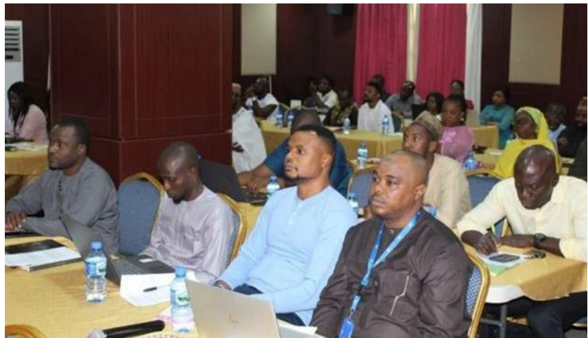
Participants during a session at the meeting