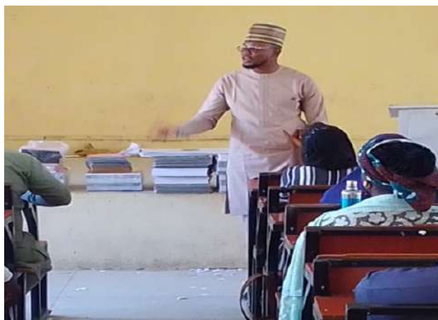
Training on recording keeping using the CHMIS during the MEPTP in Gombe state

The state project team organized a sensitization meeting with essential stakeholders to introduce them to IntegratE's demand creation strategy and seek their support and commitment for successful implementation. The Director of Community and Family Health chaired the meeting, with representatives from SMOH, GSPHCDA, ACPN, NAPPMED, and project staff also in attendance. By the end of the meeting, roles and responsibilities were assigned to participants to facilitate the recruitment of IPC Agents.