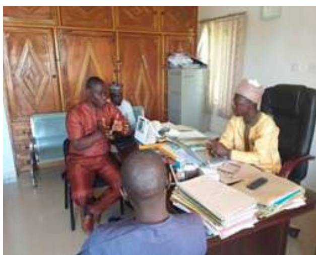
Advocacy visit to the District head prior to an outreach

Throughout the quarter, the state team actively engaged in a series of advocacy meetings with essential stakeholders, including the Director of Pharmaceutical Service (SMOH), the Director of Family and Community Health department and their team (GSPHCDA), Pharmacy Council of Nigeria (PCN), State leadership of ACPN, NAPPMED, Districts heads, and the BMGF State Representative. The primary objectives behind these visits were to maintain their ongoing support and commitment to the project while also providing them with regular updates on the status of project implementation.