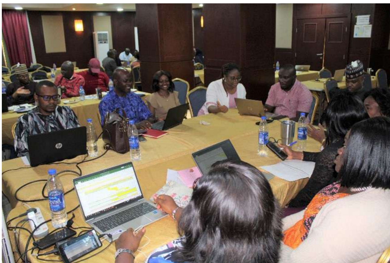
Participants during a session at the meeting

The Ministries of Health in Kaduna and Kano states, under the guidance of the Federal Ministry of Health, conducted a series of workshops and consultative meetings involving stakeholders. The purpose of these gatherings was to assess and revise the costed implementation plan (CIP) for Family Planning, covering the period from 2021 to 2023.