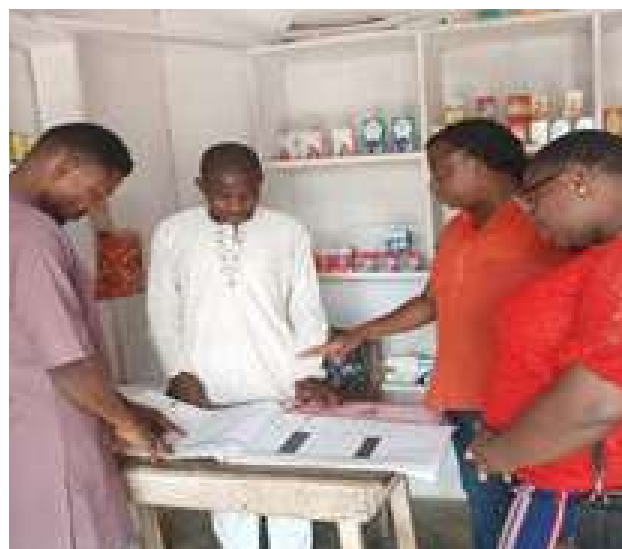
Cross section during the team visit to Badagry LGA to conduct SSV

In addition, 288 new cases of suspected pneumonia in children under 5 years were addressed with amoxicillin DT. To combat dehydration and promote recovery, 1,004 children under 5 years were administered pediatric ORS + zinc. These efforts reflect our commitment to providing comprehensive care and support to young children in our community.