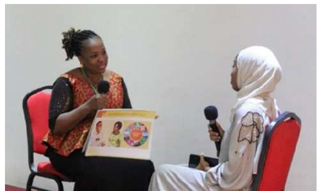
A role play session at the meeting.