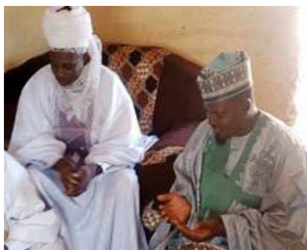
The COP with the Director Finance & Admin GSPHCDA