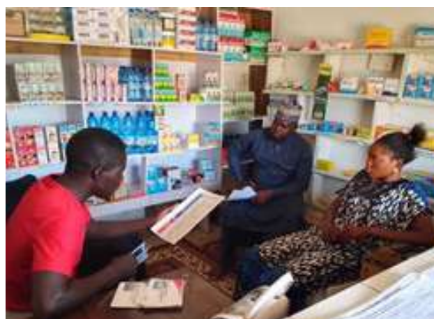
Routine and quality supportive supervision visits to mentor Providers