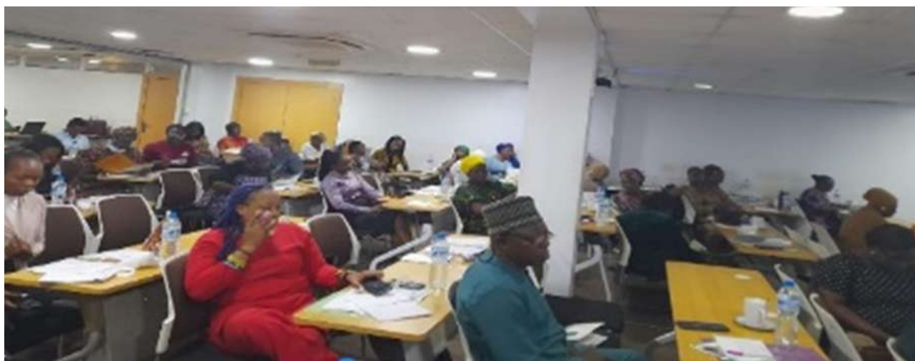
Stakeholders at the LGA RMNCAH+N scorecard

In Lagos, a stakeholders' consultative meeting on SEMA market study was conducted on November 4, 2022. The meeting's objectives were to assess the National Health Markets Framework Indicators, gather stakeholders' perspectives on Sexual Reproductive Health (SRH) market challenges and priorities in Lagos, and collectively develop recommendations to strengthen the SRH market in the state.