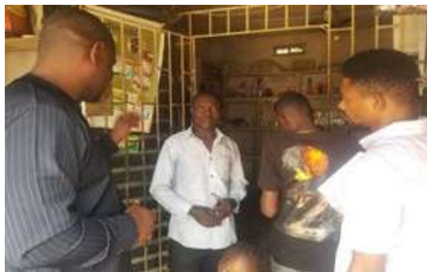
Cross section during Supportive Supervisory visit to one of the providers outlet