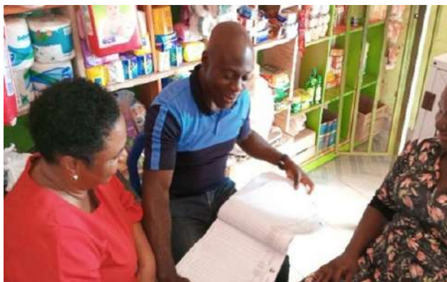
Cross section with a trained provider during DCoP's tVisit to Enugu state

Other Local government areas visited during SSV in the quarter under review are Alimosho, Ikorodu, Amumo Odofin, Lagos Mainland, Oshodi, Agege, Badagry, Ikeja, and Ifako Ijaiye of the state. Key issues observed include improve data documentation and reporting and use of family planning job aid during counseling.