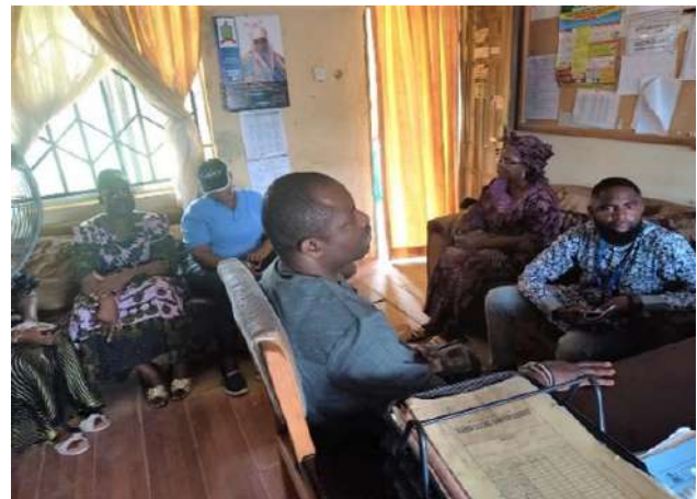
Advocacy visit to the Director Health Services (Health Secretary) Karu, LGA secretariat in company of the state PCN Coordinator, state RH/FP Coordinator and the state TS-TS focal person to seek his support to the IPCA activities in his LG.