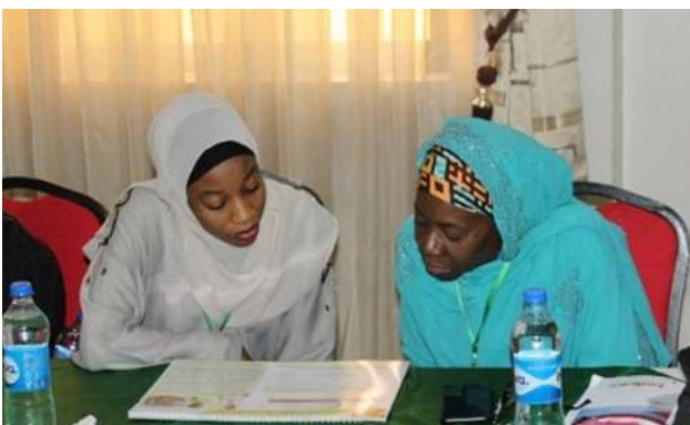
Group work session at the meeting