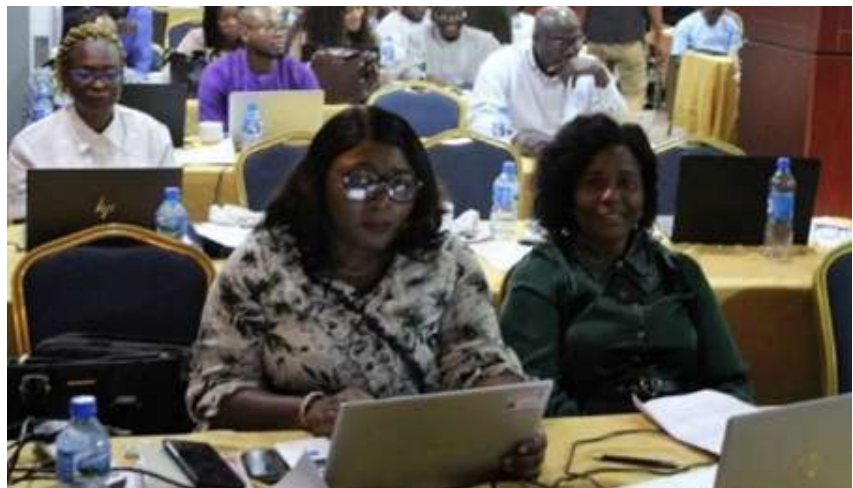
Participants during a session at the meeting