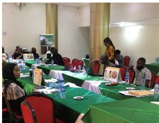
Participants during the meeting