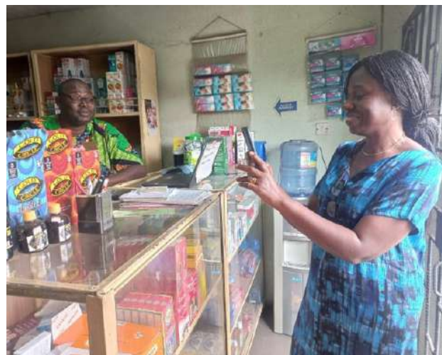
Cross section of DMD with a Trained CP Provider during her visit to Lagos

Additionally, a total of 4,832 women aged between 15 and 49 years were provided with at least one form of contraception by trained CPs (Chemical Patent Medicine Vendors) and PPMVs (Patent and Proprietary Medicine Vendors) in Lagos State. Notably, out of this group, 277 women opted for long-acting contraceptive methods.