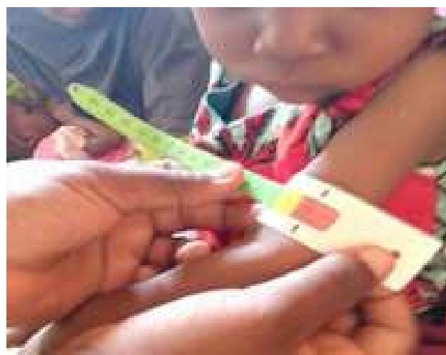
Using the MUAC tape and Malaria rapid diagnostic test kit at an outreach in Akko LGA, Gombe state