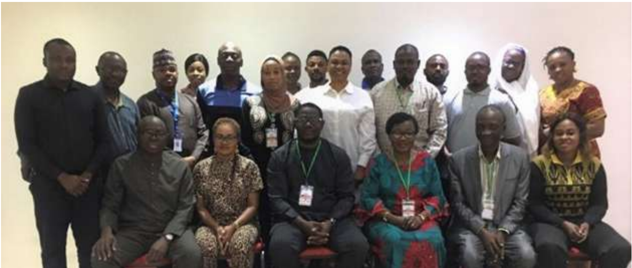
IntegratE Project team with facilitators and participants at the meeting

In November 2022, the IntegratE team, in collaboration with the Health Promotions Division of the Family Health Department, organized a Training of Trainers' workshop. This workshop aimed to equip IntegratE regional managers and state team leads with essential knowledge on Social Behaviour Change (SBC) materials concerning family planning and key household practices.